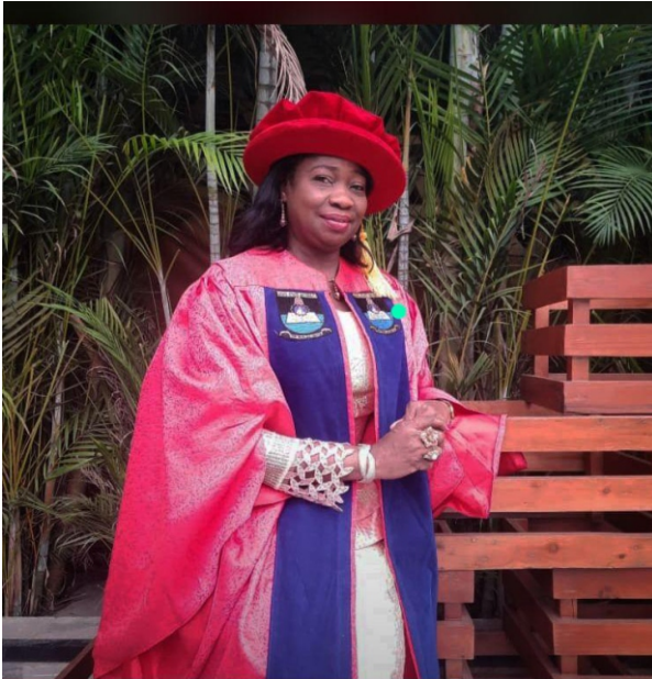
Hon. (Dr.) Abike Dabiri-Erewa

(LASU), Ojo, Lagos has deemed it fit to bestow on her the Honourary Doctorate Award during its 25th Convocation ceremony on Thursday March 24, 2022, it was one honour too many and an award well deserved. To all those who have been following the selfless and proactive impactful life of Hon. Kafayat Abike Dabiri-Erewa, one will see that it has been rewarded and appreciated with too many awards, honours and recognition of excellence too numerous to list. As at my last count, apart from those she rejected, I have counted well over 300 received since she became a public officer in 2003 to date.