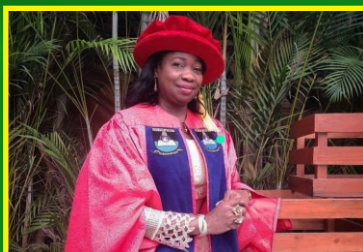
HON. (DR) ABIKE DABIRI-EREWA : AN HONOUR, WELL DESERVED

PVC, NIDCOM, NCFRMI OFFERS FREE TRAUMA CLINIC TO NIGERIAN STUDENTS FROM UKRAINE