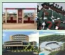
Nig. Army University