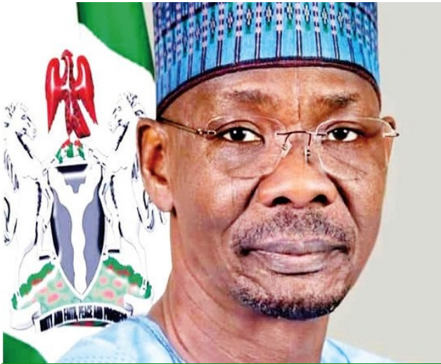
HIS EXCELLENCY ABDULLAHI SULE Governor, of Nasarawa State

I am delighted to take you on a tour to the state with the famous farin Ruwa "White waters". Welcome to Nassarawa State, the home of solid minerals and of course, the home of beautiful and hardworking men and women.