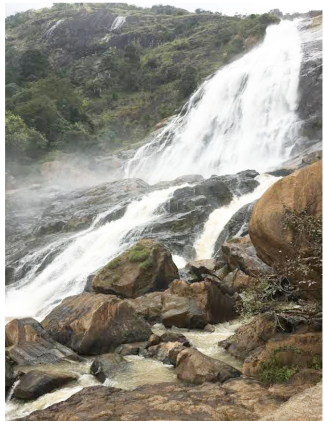
Farin Ruwa Nasarawa State