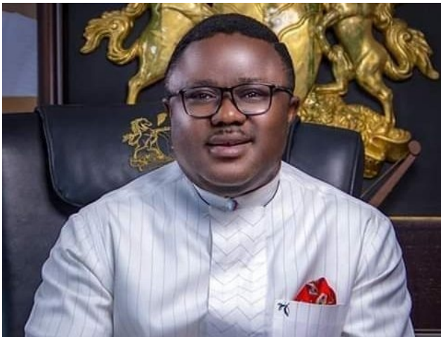
HIS EXCELLENCY Benedict Ayade Governor, of Cross River State

Let's take a trip to the southern part of Nigeria to see what Cross River state has in store for us while we're still rejoicing and praising God for enabling us to witness the end of the year.