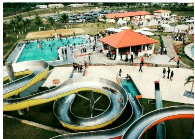
TINAPA resort.

Other places found in Cross Rivers are: Kwa falls Obudu Mountain Resort