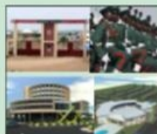
Nig. Army University