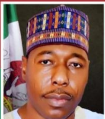
Engr. Prof. UMARU. ZULUM Executive Governor Borno State, Nigeria