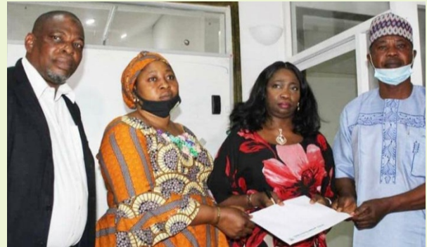
Presentation of gift to the family by NIDCOM Chairman.