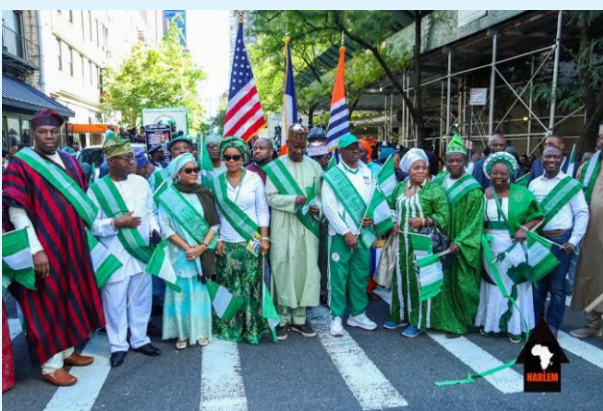
S ome Nigerians in New York, USA, celebrating the Independence Day