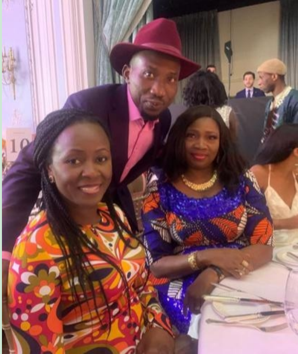
H on. Abike Dabiri-Erewa, Chairman/CEO Nigerians in Diaspora Commission (NiDCOM), at the Black Excellence Awards in London.