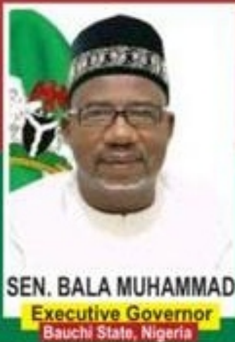
SEN. BALA MUHAMMAD Executive Governor Bauchi State, Nigeria