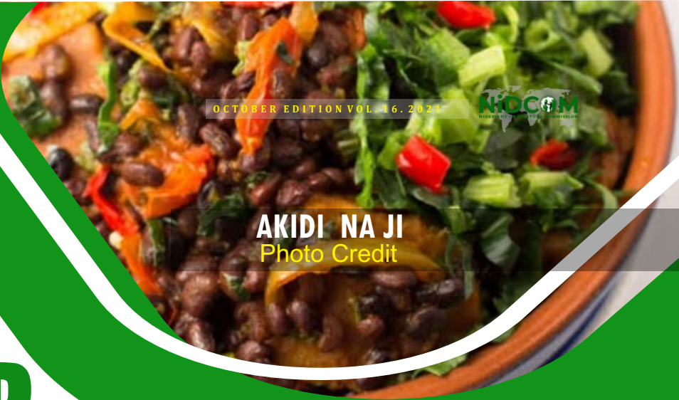
AKIDI NA JI Photo Credit