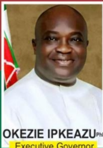
OKEZIE IPKEAZU PHD Executive Governor Abia State, Nigeria