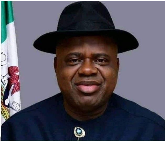
HIS EXCELLENCY Douye Diri Governor, of Bayelsa State

W elcome to Bayelsa State. One of Nigeria's largest crude oil and gas resources is located in this state. When oil was discovered in Nigeria in 1956, the first crude oil well was drilled in Bayelsa state. The oil well was around 12,008 feet deep, and it marked the start of Nigeria's shift away from agriculture towards oil and gas.