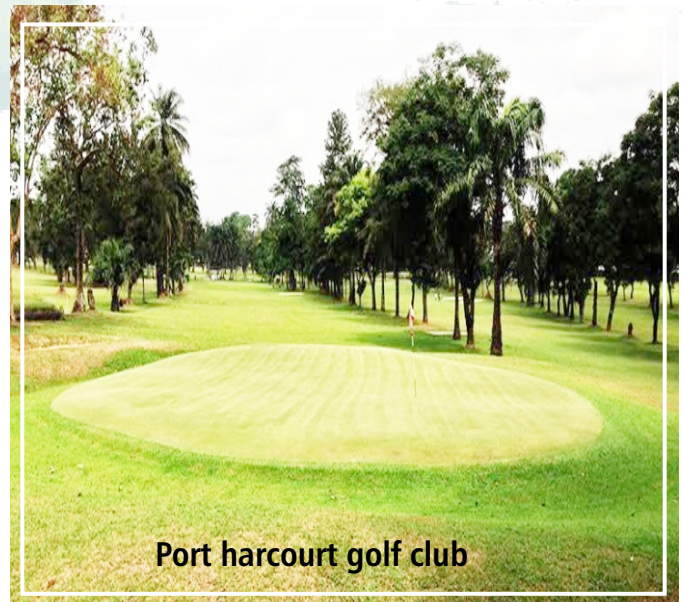
Port harcourt golf club

: The park is packed with delightful activities that suits both children and adults. Apart from the above mentioned, there are other tourist attractions in Rivers state such as: