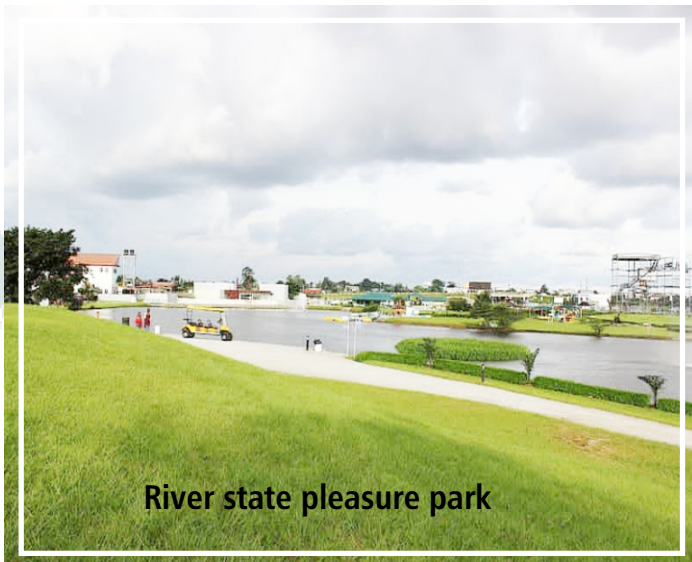
River state pleasure park

Welcome to Rivers state and one of the largest oil producing states in Nigeria. Rivers state has many interesting places to visit, especially in Port Harcourt, the state capital, also known as PH. There are so many great places to see in Port Harcourt. You will not be disappointed, if you are a tourist looking for adventure and relaxation. There are numerous tourist attractions in the state such as: Port Harcourt Golf club : here, there are other amenities to enjoy for those who do not play golf such as, swimming pool, squash court, foot ball pitch etc. Rivers state museum: This is the right place for you to visit if you are interested in culture and history. The state museum displays exhibits of cultural artifacts that shows the rich heritage of the Niger Delta. Port Harcourt Zoo: If you are a lover of animals, then, this is one place you should stop by. Port Harcourt pleasure Park