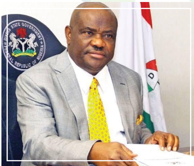
H.E Ezenwo Nyesom Wike, Governor of Rivers State.

Welcome to Rivers state and one of the largest oil producing states in Nigeria. Rivers state has many interesting places to visit, especially in Port Harcourt, the state capital, also known as PH. There are so many great places to see in Port Harcourt. You will not be disappointed, if you are a tourist looking for adventure and relaxation. There are numerous tourist attractions in the state such as: Port Harcourt Golf club : here, there are other amenities to enjoy for those who do not play golf such as, swimming pool, squash court, foot ball pitch etc. Rivers state museum: This is the right place for you to visit if you are interested in culture and history. The state museum displays exhibits of cultural artifacts that shows the rich heritage of the Niger Delta. Port Harcourt Zoo: If you are a lover of animals, then, this is one place you should stop by. Port Harcourt pleasure Park