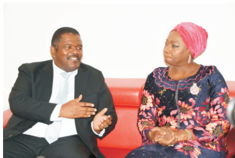
NO NIGERIAN IN NAMIBIAN PRISON. SAYS ENVOY