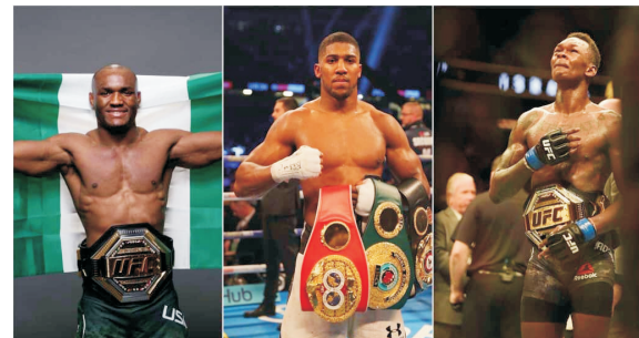
SPORTS DABIRI HAILS JOSHUA, USMAN AND STYLEBEDER FOR THEIR FEAT