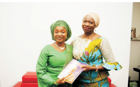
HONOURS NIDCOM BOSS, HONOURS IGINLA AINA (MBE)