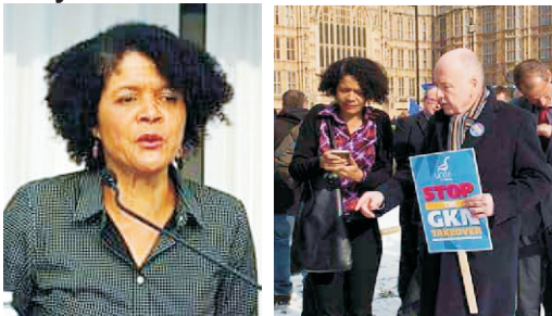
Chairman/CEO of Nigerians in Diaspora Commission Hon. Abike Dabiri-Erewa hails and congratulates Nigerian born Chinyelu Onwurah who wins first seat for Labour in the UK December 12th General Election.