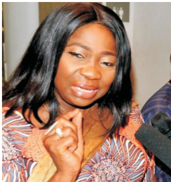
DABIRI-EREWA LAUDS JOURNALISTS EFFORTS ON MIGRATION ADVOCACY