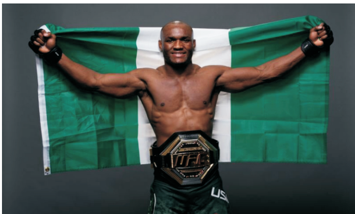
Kamarudeen 'Kamaru' Usman