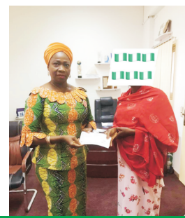
A PATRIOTIC WOMAN DONATES SALARY TO NIGERIAN RETURNÉES FROM SOUTH AFRICA