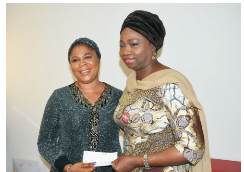
EMPOWERMENT/CSR WIDOW RETURNÉE RECEIVES #2.5M EMPOWERMENT FUND