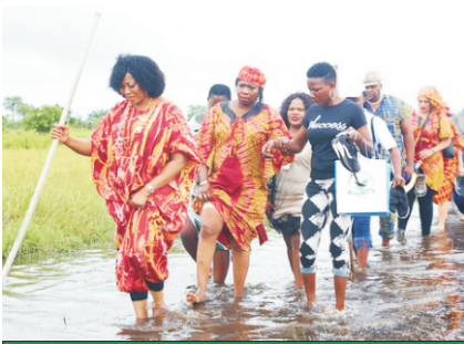
2019 BADAGRY DOOR OF RETURN CEREMONY